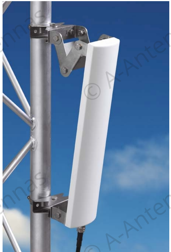
Pictured with optional tilt mount.

** Other cable lengths and connector available on demand